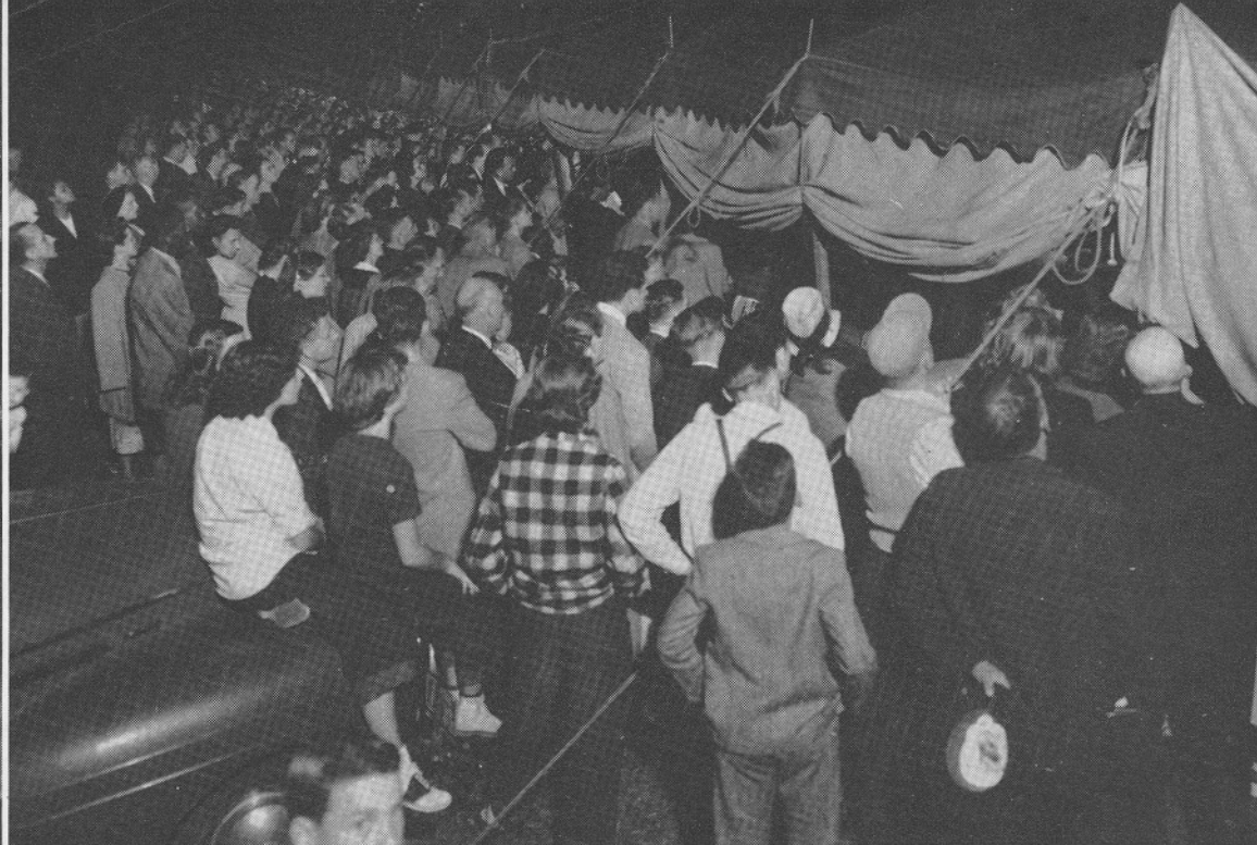
It was estimated that there were 10,000 people at the Osborn.