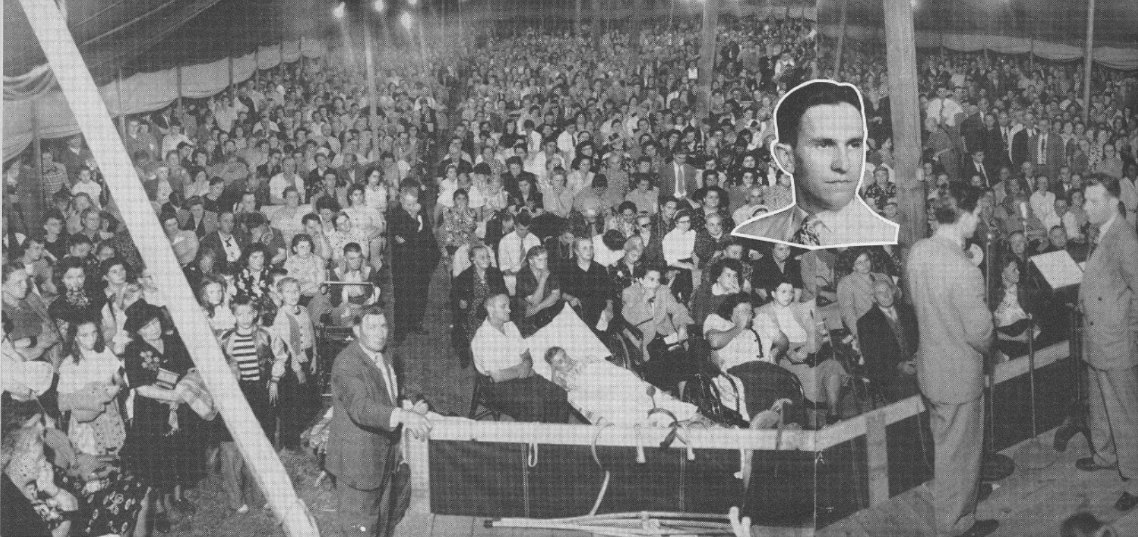
Osborn-Lindsay Healing Campaign in Reading, Pennsylvania. Some 3,000 were present on this Saturday night. On the following night, there were 4,000 in attendance. About 3,000 responded to the altar call during these meetings, and many miracles took place. Insert